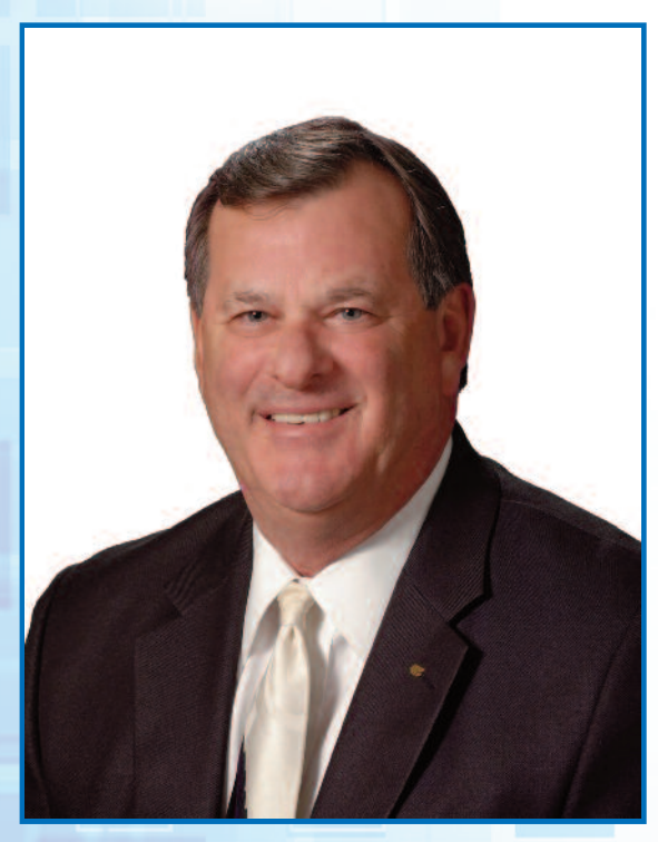
"The difference in banks lies in the manner in which customers are treated."

The year of 2011 will be remembered as a monumental year in the 26 year history of Citizens National Bank, N.A. We will more specifically discuss the accomplishments of the past year in our "year in review" section of this statement of Financial Condition, but it was an exciting year to say the least.